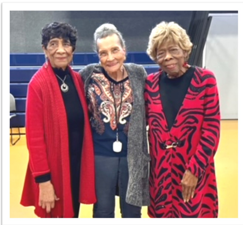
YAH Noble Nineties

We are most grateful to God and you for your love, support, and well-wishes during the past years. We are praying that God continues to bless all of us to be Spirit-filled, healthy, happy, and prosperous in 2024.