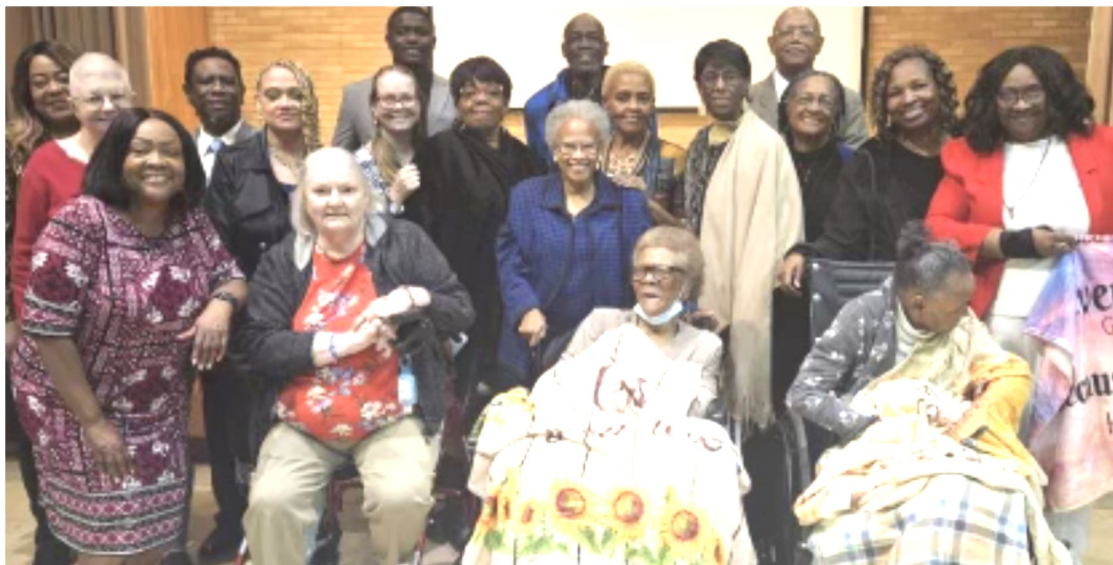
GACC Members and Residents at the Rehab

Worship and Blanket Distribution Sunday, November 12, 2023