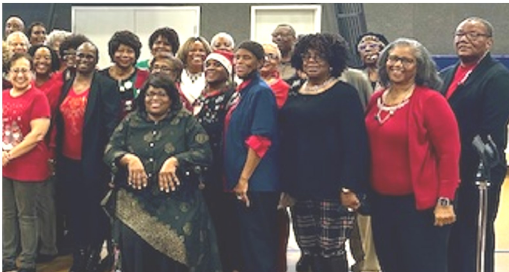
YAH Swinging Sixties