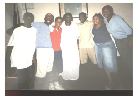
In the Bahamas