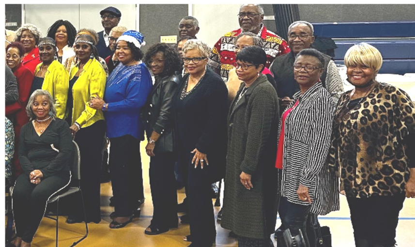
YAH Super Seventies