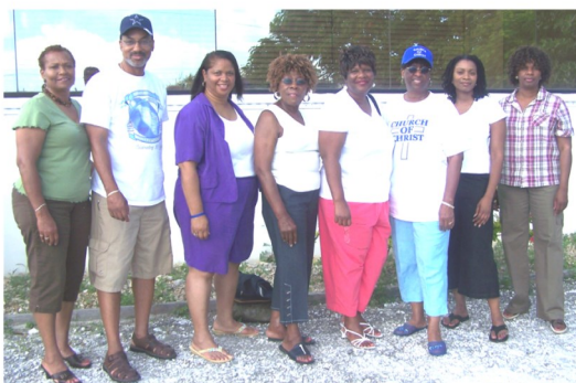
In the Bahamas