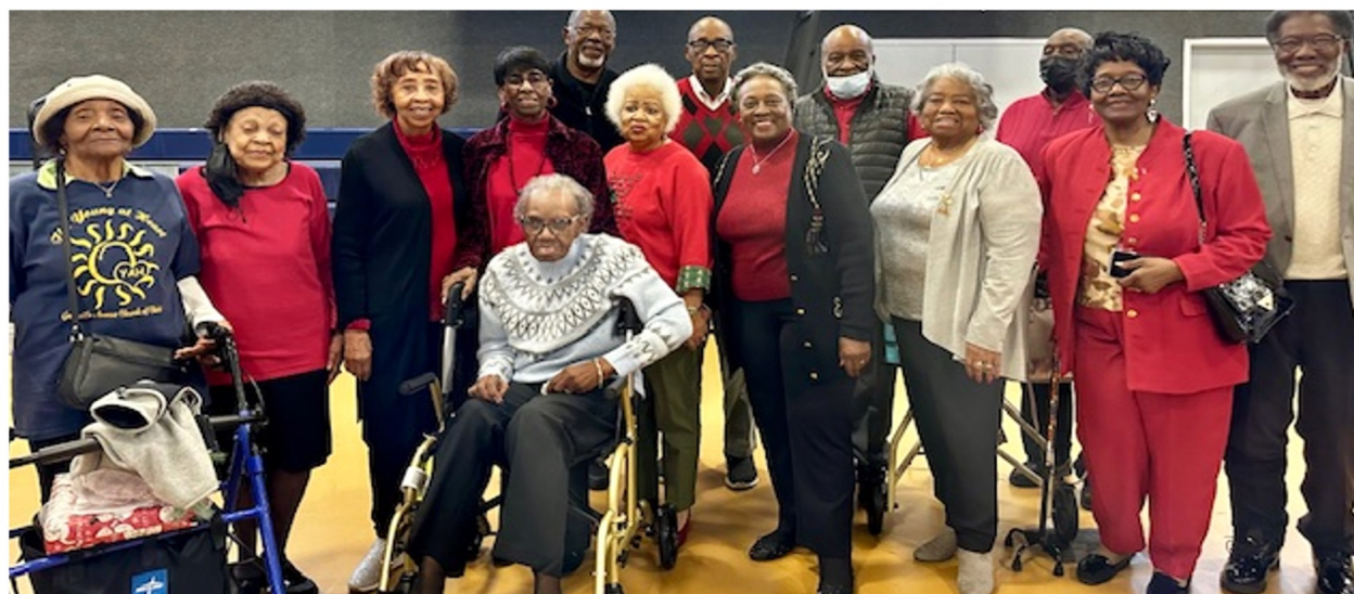
YAH Elite Eighties